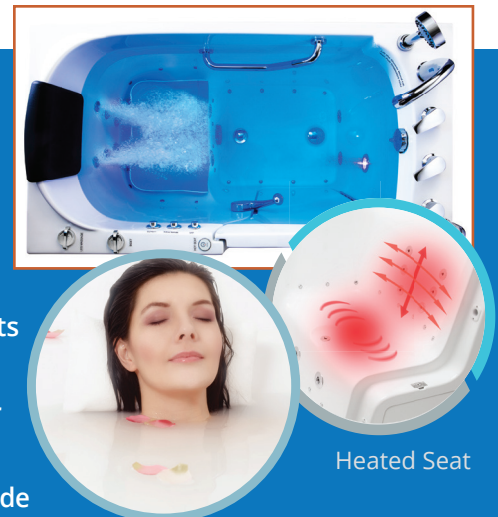
Microbubble Skin Therapy System